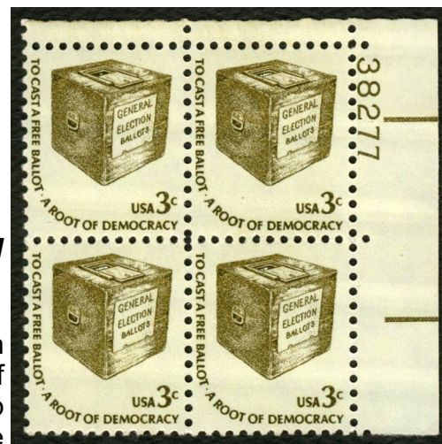
U.S. #1584 Early Ballot Box Issued December 8, 1977