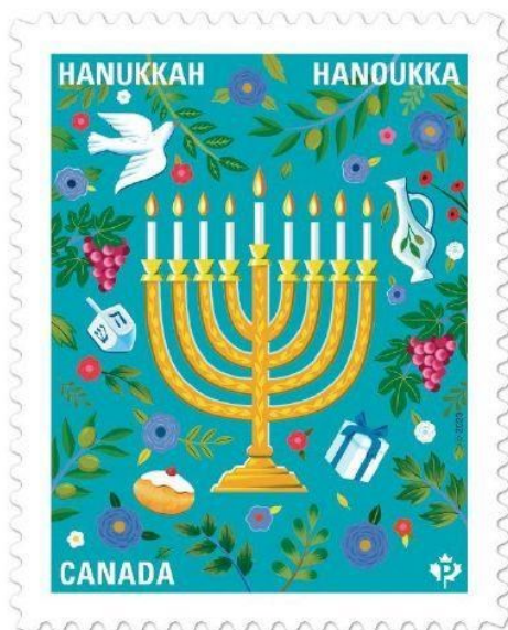
Canada #3411 Hanukkah "Festival of Lights" Issued 2023

In conclusion, we have an amazing hobby. No matter how we approach it, there is always something out there that we didn't know about or would like to have within reason. History and geography are two of my passions. I thank stamp collecting for allowing me to pursue those interests.