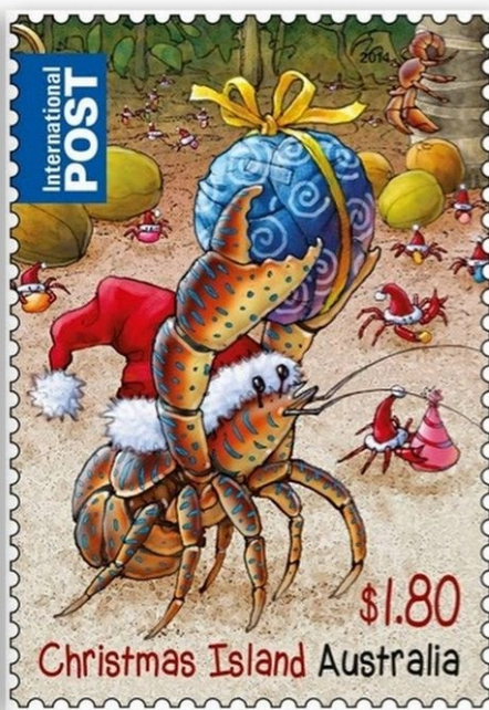
Christmas Island #532 and #533 Above left— Crab offering gift to Santa Claus Above Right— Crab holding gift-wrapped coconut