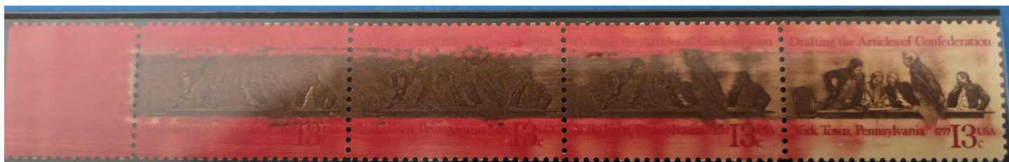
U.S. #1726 Excessive inked transition piece of the "Members of Continental Congress in Conference"